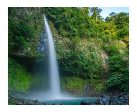
La Fortuna Waterfall Included in cost