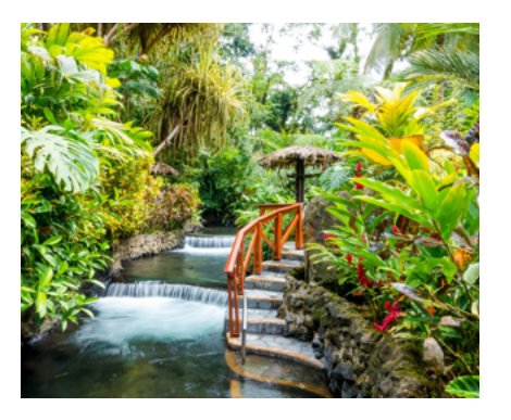
Volcanic Hot Springs Included in cost