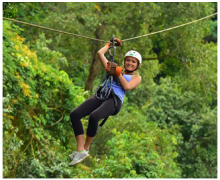
Canopy zip-line tour Included in cost