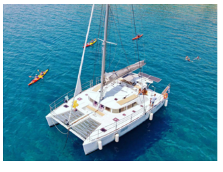
Catamaran cruise TDB