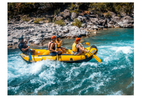
Whitewater rafting TDB